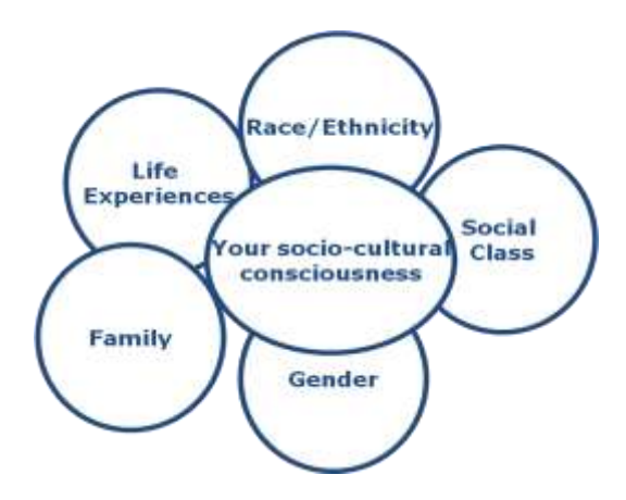
Figure 1: Socio-cultural Consciousness (adapted from Villegas & Lucas, 2002)

Socio-cultural consciousness (Figure 1) is the awareness that the way in which one sees the world is not universal, but is significantly molded by one's life experiences, tempered by such variables as race, ethnicity, social class and gender. Understanding that an individual's perspective of these variables is more a representation of personal experiences, and that they may not be shared by others, is a prerequisite for effective communication in a multicultural society (Villegas & Lucas, 2002). On a continuum of socio-cultural consciousness or dysconsciousness, we mirror our personal experiences and views of the world in our teaching.